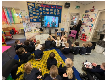
National Poetry Day